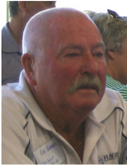
Picture taken at last seasons Heritage Day 13.08.1937 - 21.06.2009